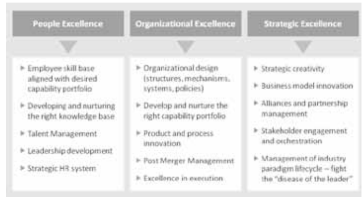
Exhibit 1: Corporate Learning Domains

business practice that is indispensable for the long-term survival of the firm. ■